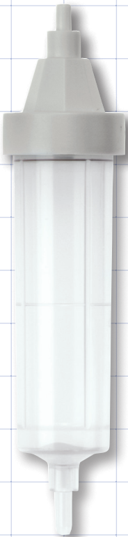
43515 Drip Chamber, In-Line with Solution Filter 15 Micron 0.13 inch OD (3.3 mm) 20 Drops/ml ABS, PA, SB