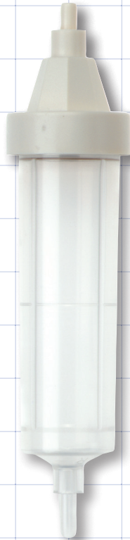
43509 Drip Chamber, In-Line 0.3 inch OD (3.3 mm) 20 Drops/ml ABS, SB