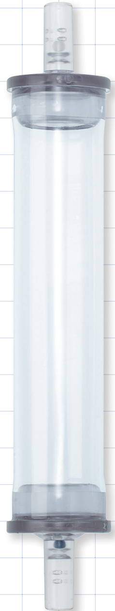
41484 Hand Pump Fits 0.17 inch OD Tubing (4.3 mm) PP, PVC