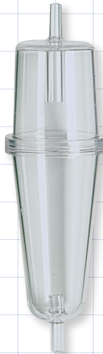
41445 Drip Chamber 0.3 inch OD (3.3 mm) ABS