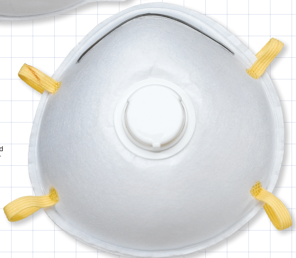
33053 N95 Particulate Respirator Mask, Molded Cup, Valved, Round Shaped Nylon/PU Blend, PP, PU, Polyester