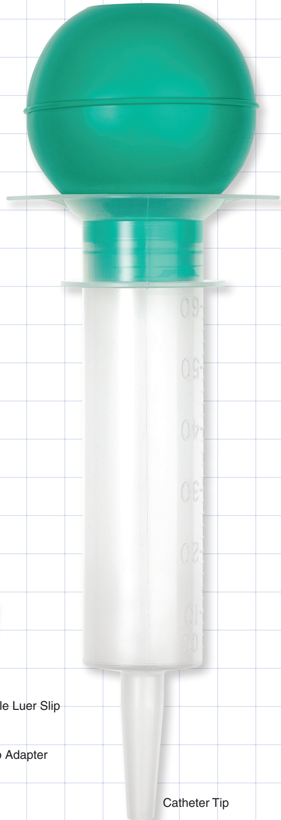
56609 60 cc PE, PP, PVC