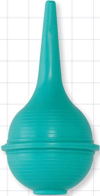
32029 1 oz. PVC