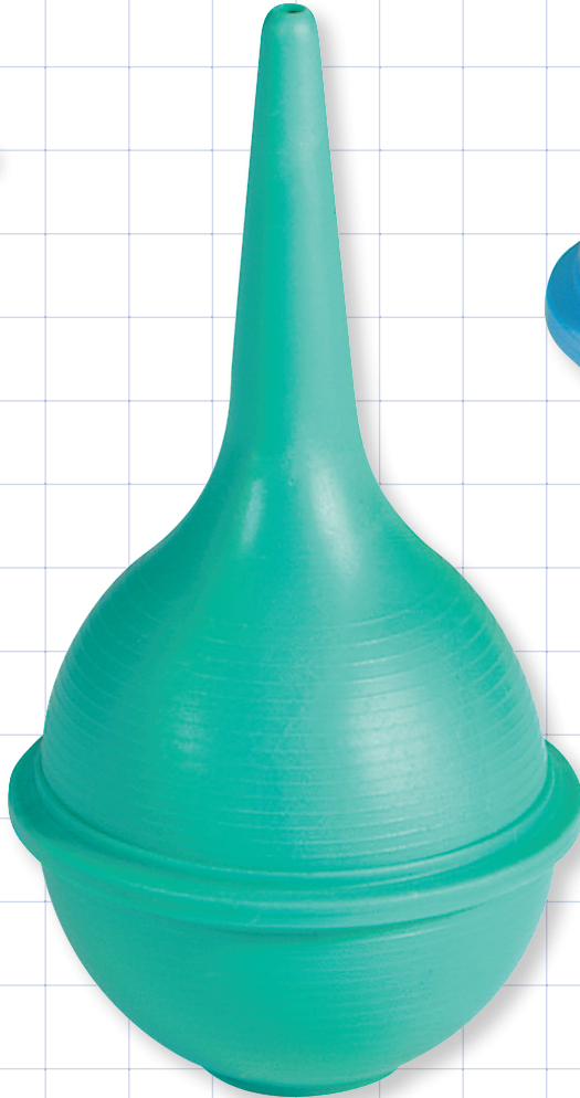
32010 3 oz. PVC