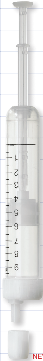
C2200 NEW! Syringe, Removable Male Luer Slip with Cap, Break Off Plunger 10 ml PE, PP