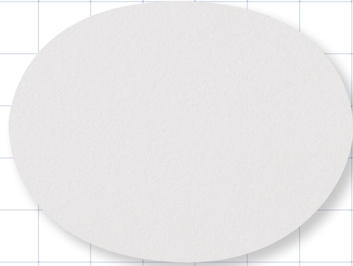
73028 2.625 inch x 2 inch x 0.25 inch (67 mm x 51 mm x 6.4 mm) PU