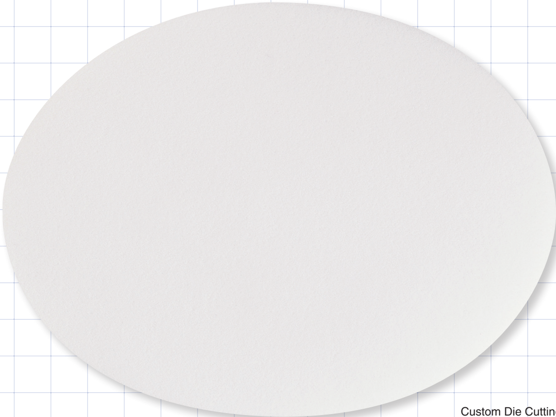
73030 6 inch x 4.5 inch x 0.25 inch (152 mm x 114 mm x 6.4 mm) PU