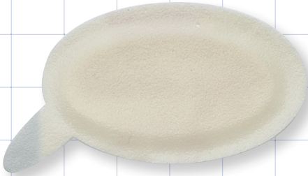
509000 Eye Adhesive Shields with Tabs 1.15 inch x 1.88 inch (302 mm x 48 mm) Latex Free Acrylic Pressure Adhesive