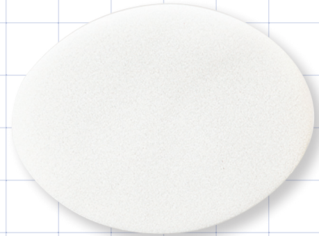
96618 PVA Foam Eye Pad 2.125 inch x 1.625 inch x 0.093 inch (54 mm x 41 mm x 2.4 mm) PVA