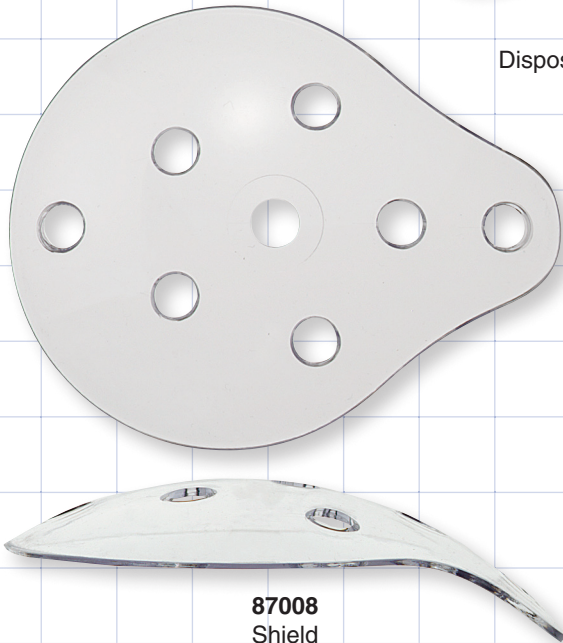
87008 Shield Large, Clear PC