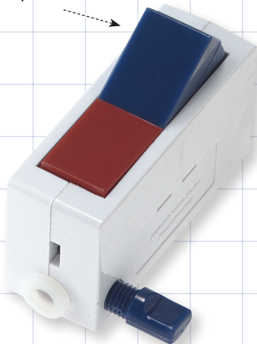
14053 Snap Action Pinch Valve with Flow Control Fits 1/4 inch OD Tubing (6.4 mm) Nylon, PC, Steel