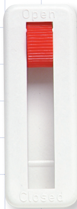
14029 Fits 0.161 inch - 0.204 inch OD Tubing (4.1 - 5.2 mm) POM