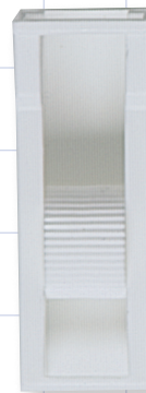
140201 Roller Clamp Body for 140202 Roller Clamp Wheel Fits 0.18 inch OD Tubing (4.6 mm) PVC