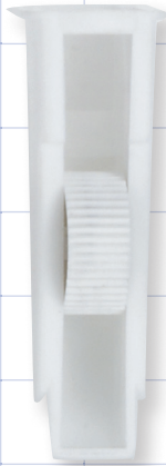
14049 Fits 0.256 inch OD Tubing (6.5 mm) PP, ABS