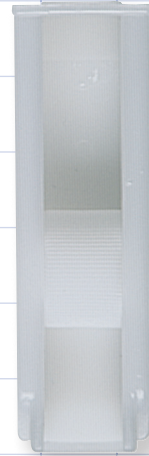
140221 Roller Clamp Body, White for 140222 - Roller Clamp Wheel Fits 0.268 inch OD Tubing (6.8 mm) Acetal