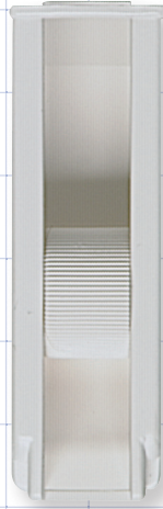
140211 Roller Clamp Body, White for 140212 - Roller Clamp Wheel Fits 0.268 inch OD Tubing (6.8 mm) ABS