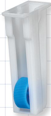
33046 Fits 0.14 inch OD Tubing (3.5 mm) HIPS, PP