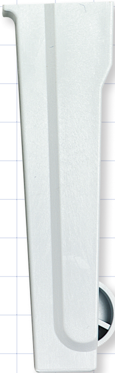
140281 Roller Clamp Body, White, for 140282 - Roller Clamp Wheel Fits 0.47 inch OD Tubing (12 mm) ABS