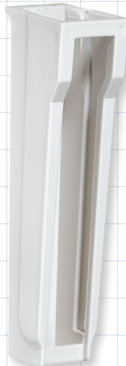
33035 Roller Clamp Body, White, for 33036 - Roller Clamp Wheel Fits 0.47 inch OD Tubing (12 mm) ABS