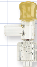
80204 0.138 inch ID (3.5 mm) ABS, Polyisoprene