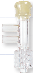
80016 0.094 inch ID (2.4 mm) ABS, Isoprene, SB, PVC