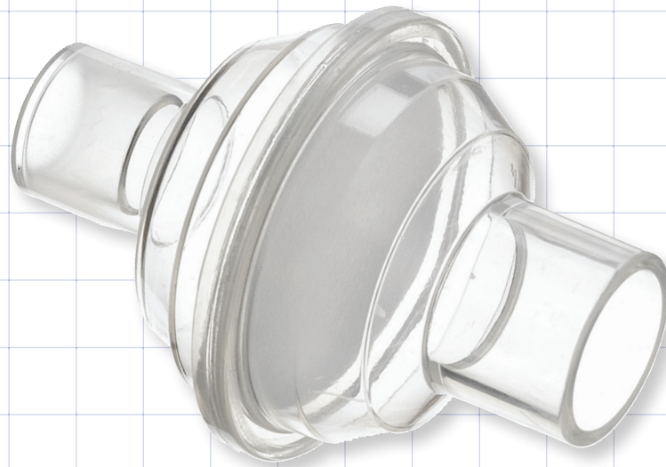
11671 15 mm ID/22 mm OD x 22 mm ID K-Resin, PP

For additional Filter see please page 114